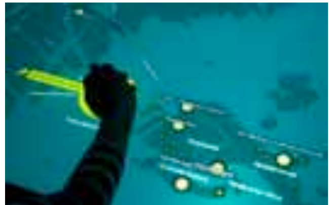
Figure 3. Exploring relations between projects

position so as to not interfere with the facet item selection (which is at West). Keeping the same interaction mechanism, users select a category by moving the object towards its respective orientation. By rotating the object inside the ring users can explore project information in detail: scrolling through the descriptive text, and browsing through explanatory pictures (Figure 2 c). Selection of the third category (“relations”) activates the project's conceptual network with other projects (Figure 3).